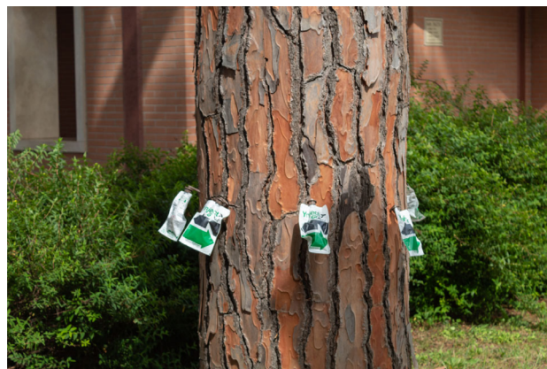
Figure 1. Endotherpic abamectin treatment on stone pine plants. Injection through the pressurized bags into the plant trunk.

After the date of the endotherpic treatment, six 20 cm-long twigs were randomly collected by reaching into the canopy of each treated and untreated plant with a basket crane and sampled fortnightly. After the cut, each twig was sealed into a plastic bag, brought to the laboratory and inspected within 24 h. Additionally, two other twigs were randomly collected by the treated plants and designated to multiresidue analysis.